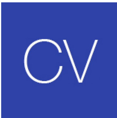
WIRE MESH CONVEYOR BELTS (CV)